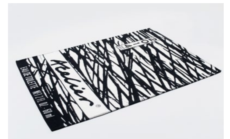
Fade to Grès Atelier E.B. (Beca Lipscombe)